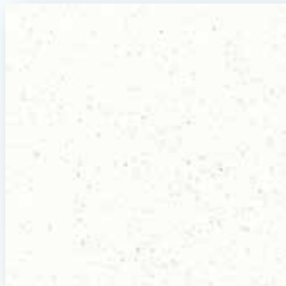
7008 - PREMIUM WHITE