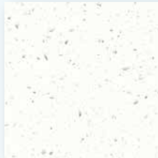
7850 - ALPINE WHITE