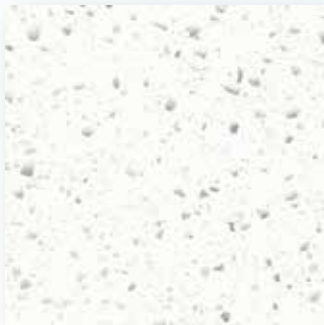
7009 - FROST WHITE