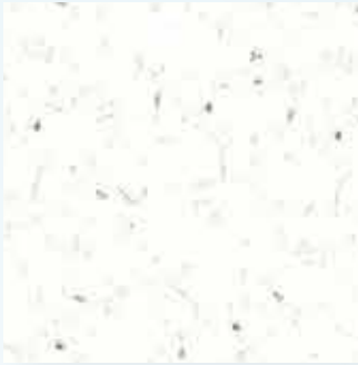
6501 - CARRARA WHITE