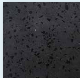
7304 - BLACK ALTA