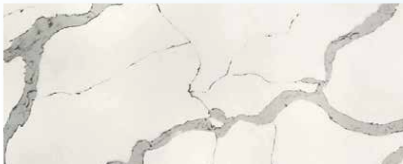
6089 - CALACATTA