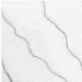
CALACATTA SUMMER WHITE