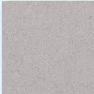
7611 - METROPOLIS GREY