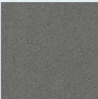
3032 - SANDBAR GREY