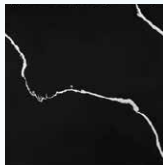
CALACATTA SUMMER BLACK