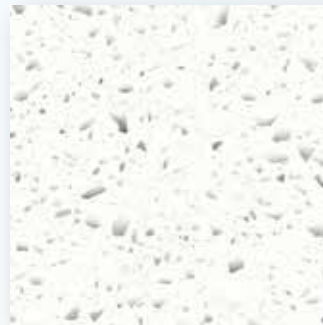
7045 - NUGGET WHITE